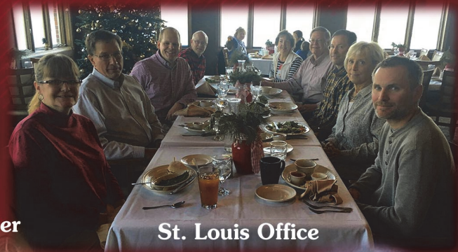
St. Louis Office